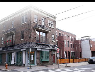
■ Original location of First African Presbyterian Church at 7th and Bainbridge Street. The congregation moved to West Philadelphia on Girard Avenue.

The leaders of Lombard Central Presbyterian Church faced many barriers. Throughout the years all have advocated for education and civil rights in their communities.