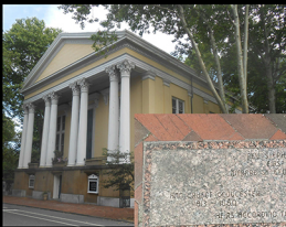
■ In 2008, while the original Lombard Central sanctuary was being converted into a “luxury” home, Stephen Gloucester’s remains were discovered and relocated to Old Pine Presbyterian Church behind PHS.